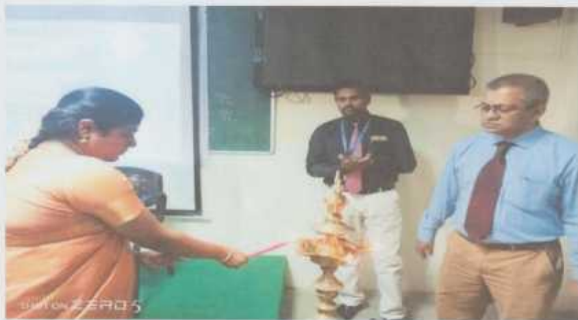
Lightning the Kuthuvilaku