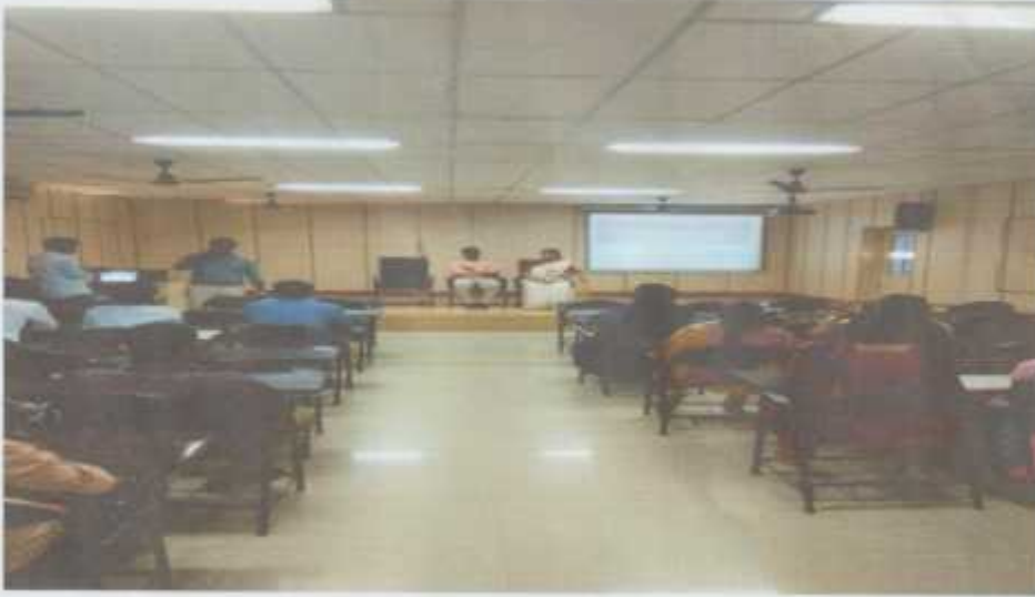
Resource person interaction with students