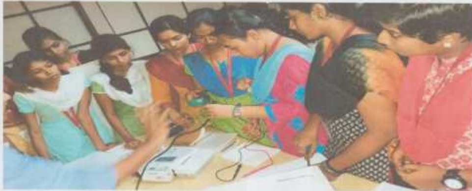
"Students presenting their new incubation project ideas to the chief guest"