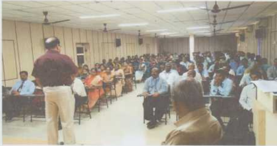
"Resource person delivering the lecture"