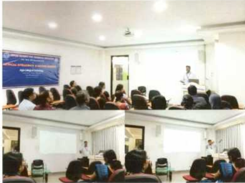
STTP on Artificial Intelligence & Machine