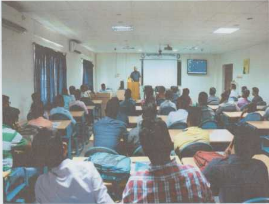
Resource person delivering the lecture