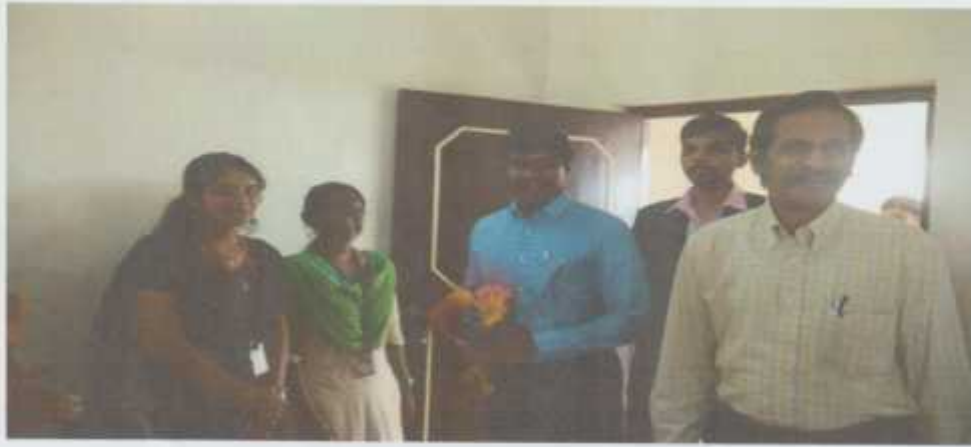
"Student facilitating the chief guest with bouquet "