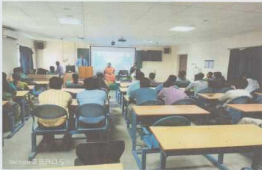
"Principal Delivering the Inaugural Address"