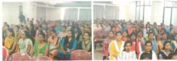
Students Entrepreneurs at ESE Start-up Incubation Program