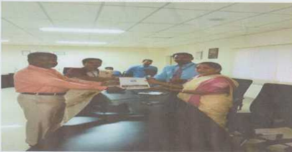
Chairperson honouring the resource person