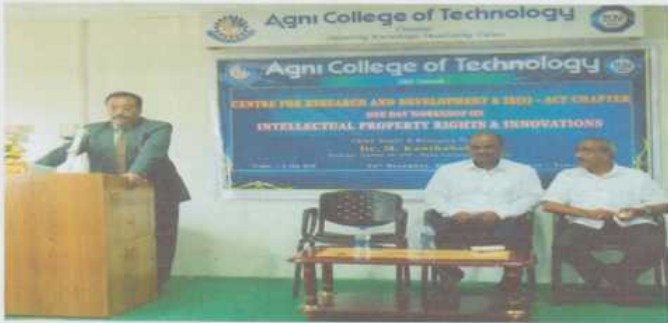
"Principal Delivering the Inaugural Address"