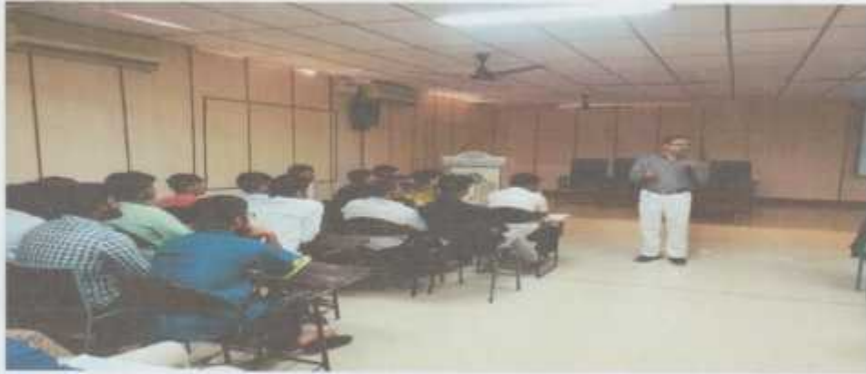
Resource person interaction with students