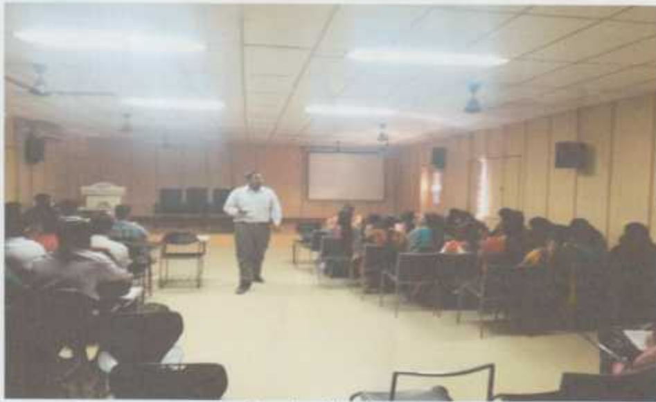
Interaction with participants