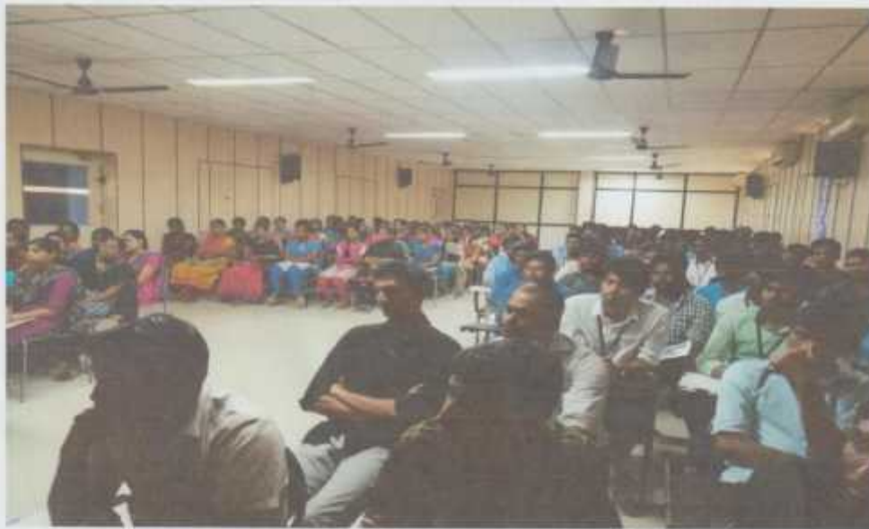
Students of Agni College of Technology