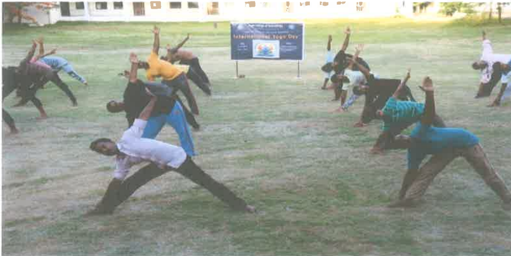
Our student were eagerly participating the different type of postures in the International Yoga Day held at Agni college of Technology.

Note: Photos of the programme is attached below: