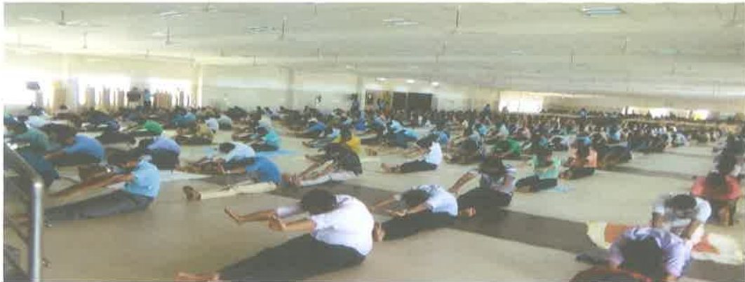
Students are eagerly performing Surya Namaskar postures on international yoga Day held at Agni College of Technology.